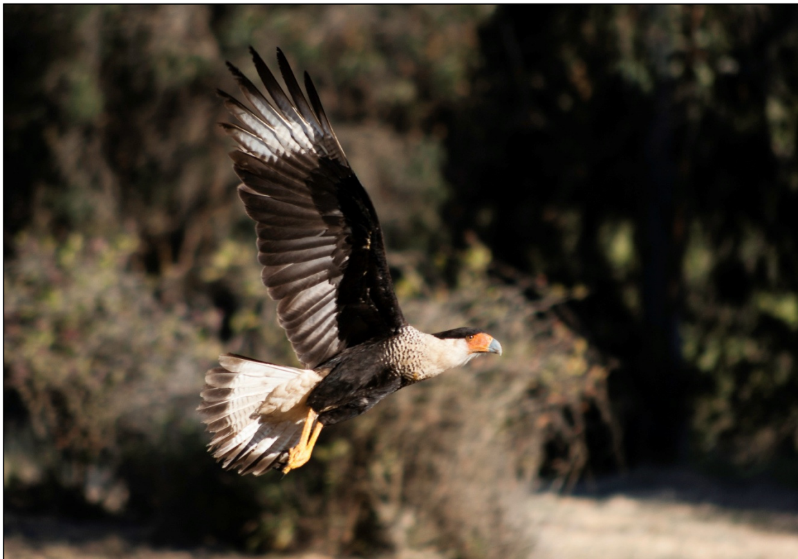
Crested Caracara in Middle Ranch, 28 April 2014. This individual, the first ever recorded for Catalina, arrived on 25 April 2014 and is still present as of the date of this draft.