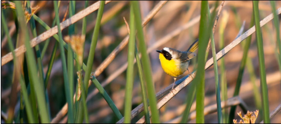
Common Yellowthroat near a nest site in Middle Canyon, 1 May 2013.