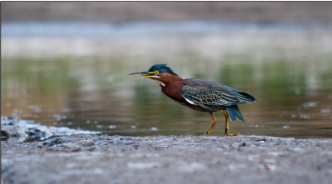
Green Heron at Thompson Reservoir, 18 November 2013.