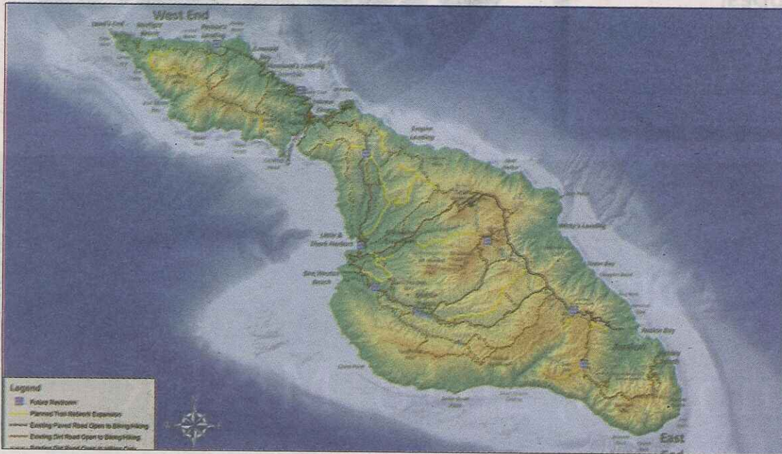
The Catalina Island Conservancy trail system will be expanded throughout the Island. The yellow lines indicate the planned trail network expansion. Map courtesy of Laura Roll